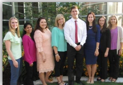
2018 PGY1 and PGY2 Augusta Campus Residency Class

http://cap.rx.uga.edu/index.php/academics/residency_program/